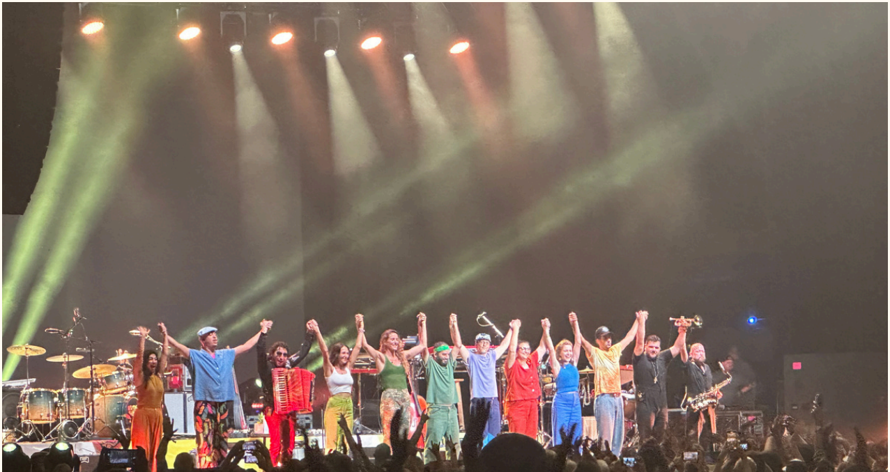
Caption: Jason Mraz and band taking bows after concert on July 6th, 2024.